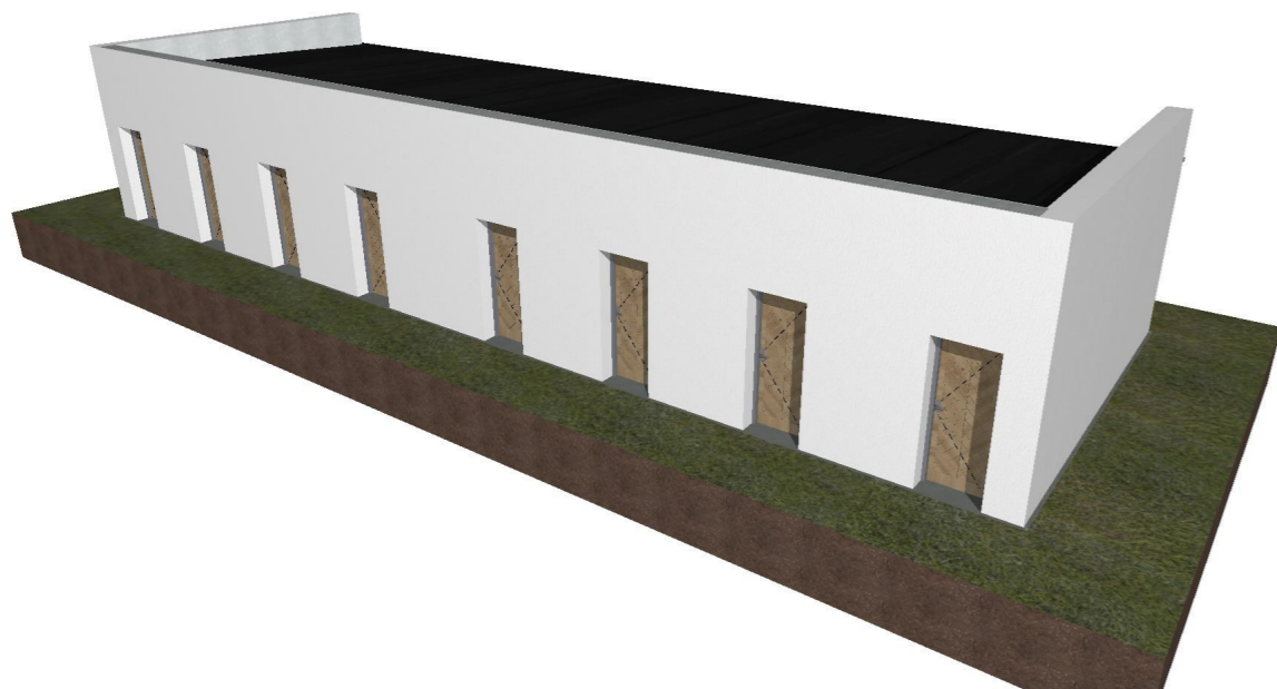
A 3D architectural rendering of a long, white, rectangular building with a black roof. The building features a series of small, rectangular windows along its side. It is situated on a green field, and the ground is shown in a cross-section view, revealing a brown soil layer beneath the grass.